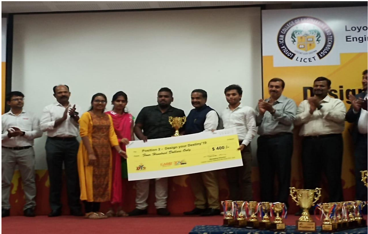
EEE students receiving US $400 cash prize